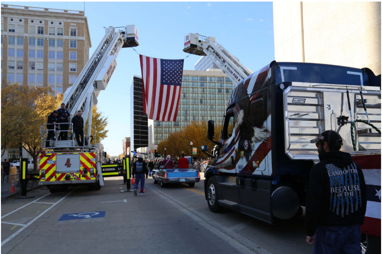
Tulsa Veterans Day Parade